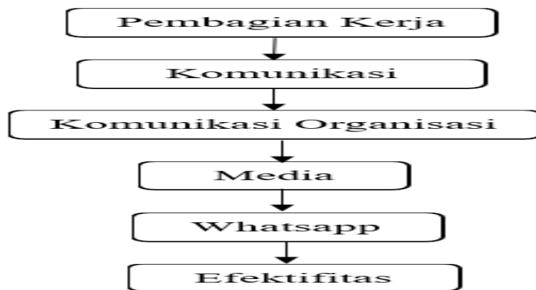
Gambar 2. 1 Kerangka Berfikir